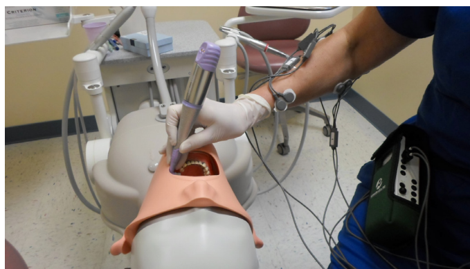
Pictured: Mannequin, typodont and participant with EMG electrodes attached to skin over 4 muscle sites for recording electrical activity of muscles.