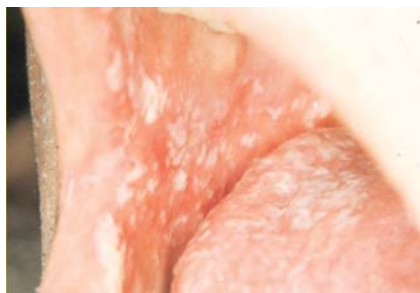
Figure 4. Candidiasis.

Poor glycemic control has been associated with the predisposition of diabetic patients to infections. The presences of high levels of glucose in the bloodstream decrease the ability of leukocyte chemotaxis, and phagocytosis. In general, blood glucose of 250 or more place the patients in a compromised situation