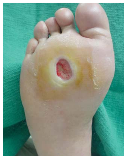
Figure 3. Neuropathic ulcer secondary to neuropathy and deformity in a diabetic patient.

problems including peripheral neuropathy. Patients should be counseled on the risk of developing neuropathy. About 80% of all patients with diabetes experience lack of sensation that is combined with repetitive stress with tissue break down and then eventually infection. 30 Patients with diabetic neuropathy alone are 1.7 times more likely to develop pedal ulcerations and are 12.1 times more likely to have foot deformities. 31 The etiology of diabetic neuropathy is not clearly understood, but one major theory has been described as angiopathy of the vasa nervosum causing ischemia of the nerve. Evidence of the metabolic disturbance has been found, including the accumulation of intraneural sorbitol and glycosilation of the nerve protein and reduction of