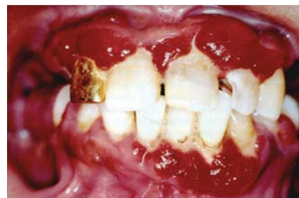
Figure 5: Periodontal Abscess/ Type 1 Diabetes Mellitus

Slide from "Diabetes and the Dental Professional" courtesy of Colgate-Palmolive Company