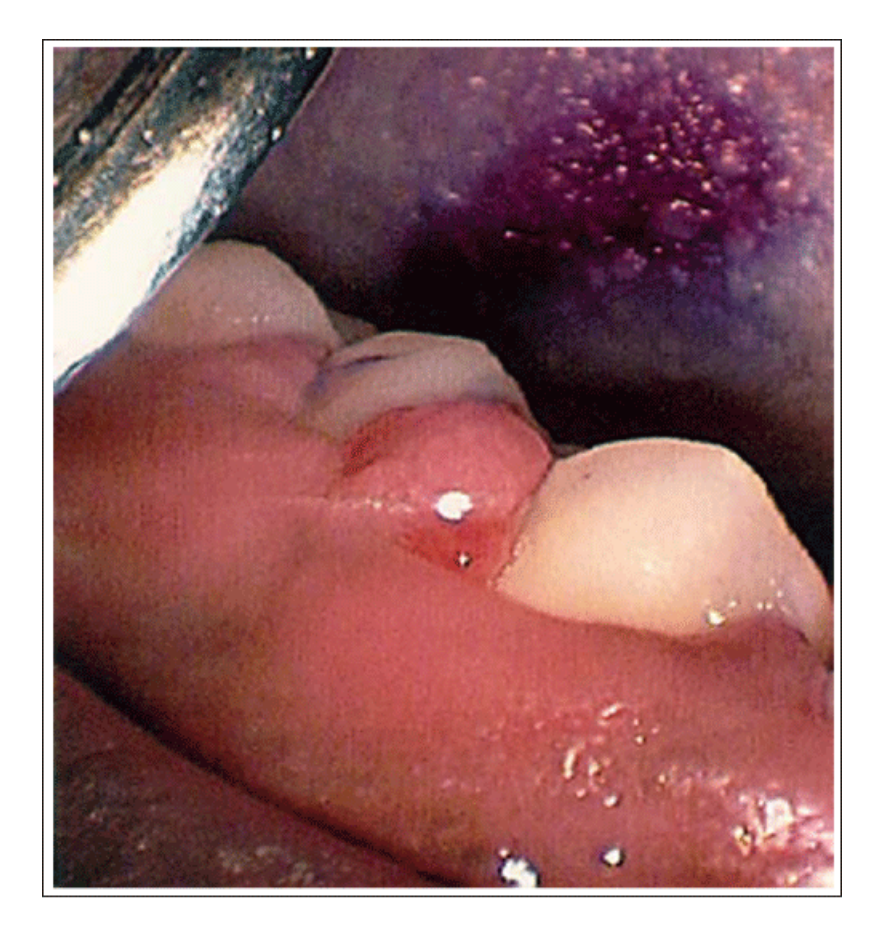
Figure 13. Pyogenic granuloma, interdental papilla area, #'s 28 & 29

Although most fibrous hyperplasias are relatively innocuous lesions, histologic examination of the tissue is necessary in most cases to rule out the possibility of malignancy. Though they are not considered true tumors, fibrous hyperplasias may continue to increase in size until the stimulus or irritation is removed or the lesion is excised. The patient in this case study was a smoker, a trait which places her at greater risk for oral cancer, making early diagnosis more paramount. The delay in complete excision of the lesion may have required more extensive surgical intervention than if the patient had returned for post-operative visits following the initial biopsy.