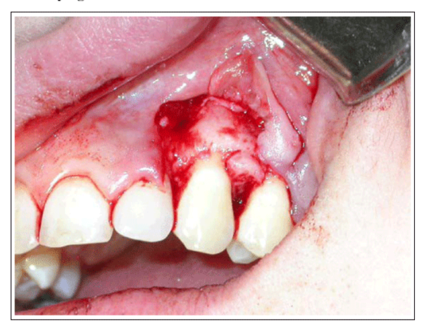
Figure 6. The connective tissue lesion is excised and submitted for histologic examination and diagnosis