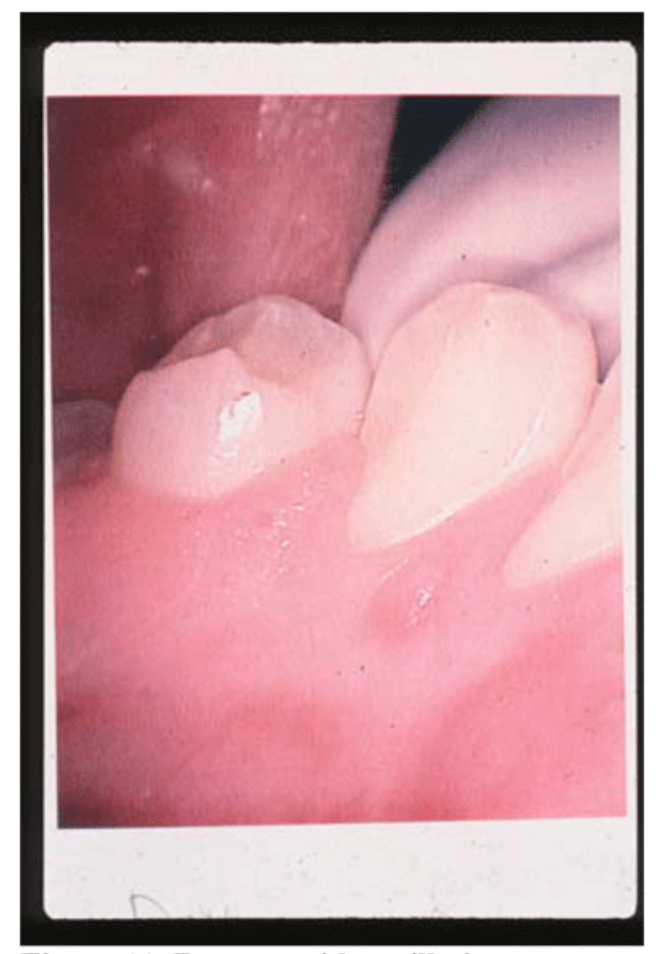
Figure 11. Retrocuspid papilla in a young female college student

The clinical diagnosis of ossifying fibroma was a logical inclusion in the differential diagnosis of this lesion, as it can look much like the GCF clinically.<sup>15</sup> (Figure 12) Ossifying fibromas are typically normal mucosal color like GCFs, but they have islands of osteogenic cells dispersed throughout the lesion.<sup>7,8,9,10</sup> Unlike GCF, peripheral ossifying fibroma is found only in the gingiva, occurs more in females, and is thought to arise from the periodontal ligament.<sup>7,8,9,17</sup> Like GCF, it is found more in young adults and recommendations for excision include periodontal root planning.<sup>7,8,9</sup> The gritty or grainy feel noted during the biopsy may have also reinforced the surgeon's original impression concerning the type of lesion being excised. The clinical diagnosis was not likely to have been papilloma, which is a common misdiagnosis of GCF. Most have a bosselated or papillary surface, but this was merely a smooth, round, sessile enlargement of the attached gingiva.