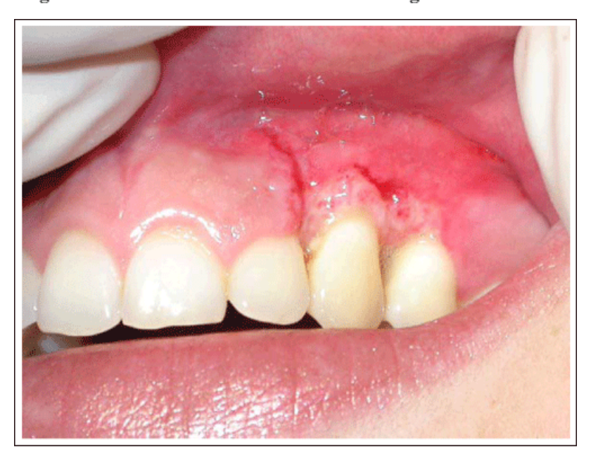
Figure 8. One week post-op