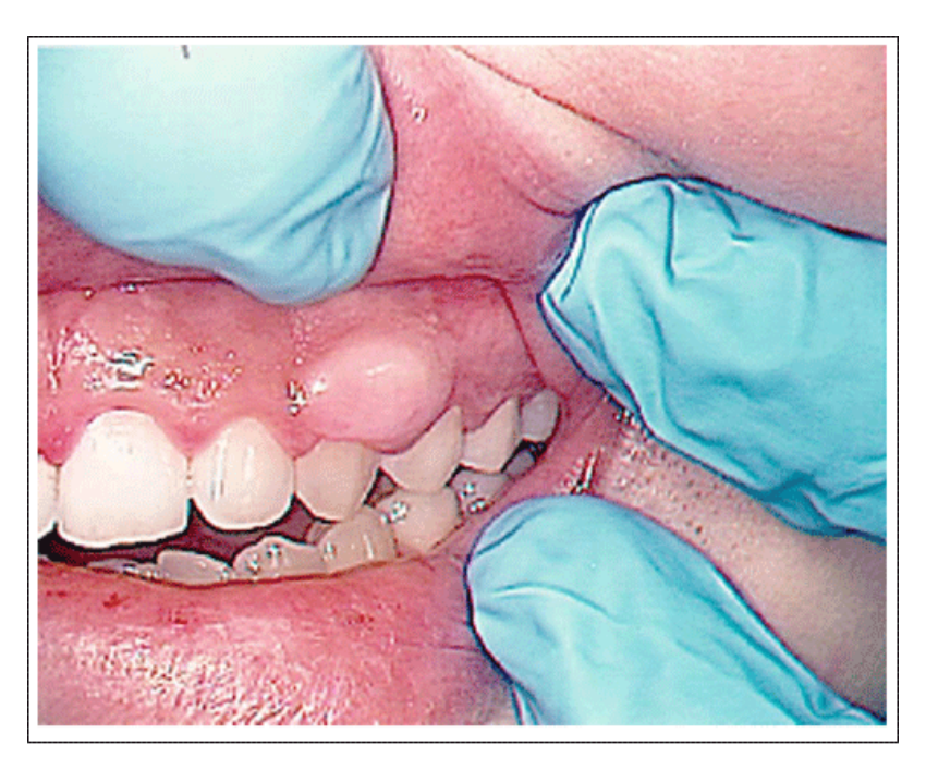
Figure 3. Case study patient, three years later

After delivering a healthy baby boy, the patient again returned to the dental hygiene clinic for preventive care the following year. She reported that the lesion noted at the two previous visits seemed to increase in size during her pregnancy. It had since been biopsied at the dental school but had not been totally excised (Figure 4). Per her request, a follow-up report was received from the dental school for her records in the dental hygiene clinic, as it remained her primary source of dental care. The report stated that radiographs of the lesion exposed at the dental school were unremarkable, and the clinical diagnosis was ossifying fibroma. The lesion was biopsied in the oral surgery department and submitted for histologic evaluation. A note was included about a grainy or gritty feel to the lesion during excision. The pathology report revealed parakeratinized stratified squamous epithelium on the lesion's surface. The submucosa was composed of fibrocollagenous connective tissue exhibiting large stellate fibroblasts. Diagnosis by the pathology department was GCF.