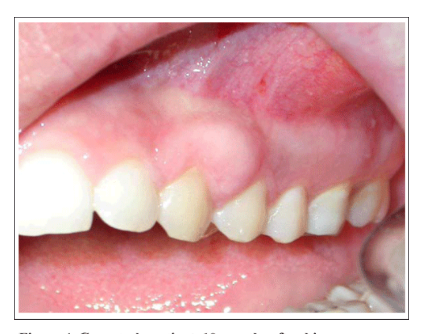
Figure 4. Case study patient, 10 months after biopsy

The patient did not return for post-operative evaluation at the dental school until 10 months after the biopsy. There remained what was noted as a "swelling" in the area of teeth #s 10, 11, and 12. Complete excision of the fibroma was advised. Due to aesthetic concerns about gingival contour, she was referred to the graduate periodontal department where the lesion was fully excised (Figures 5, 6, 7, 8, 9). A second pathology report was requested with a diagnosis of "consistent with focal fibrous hyperplasia-gingiva." The patient was informed about the fibroma's possible recurrence, which might require extractions and ostectomy. At post-operative visits she expressed concern about the apically positioned gingival margin and the aesthetic difference when compared to the right side. Discussions were started about possible gingivoplasty after healing. The patient again requested release of information to the dental hygiene clinic and is contacted for routine recall appointment.