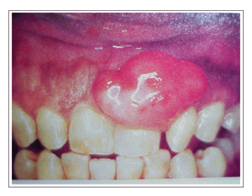
Figure 12. Ossifying Fibroma, maxillary anterior

Color and vascularity of lesions can also be distinguishing features when diagnosing fibrous hyperplasias. Most irritation fibromas are of normal mucosal color, unless traumatized, in which the lesion could appear reddened, or whitish due to hyperkeratinization, the result of continued irritation after development of the lesion. Pyogenic granuloma, on the other hand, is commonly found on the gingiva (like GCF), but tends to be red<sup>7</sup> and bleeds easily if manipulated, unlike most GCFs and the lesion in this case study (Figure 13). It was of normal mucosal color and had no associated bleeding. Had the patient first visited the clinic during her pregnancy, it is conceivable that the lesion could have been mistaken for a pyogenic granuloma, which is commonly found on the gingiva of pregnant women and, if a mature lesion, can be pink instead of red. It is interesting, however, that she perceived the lesion to increase in size during her pregnancy.