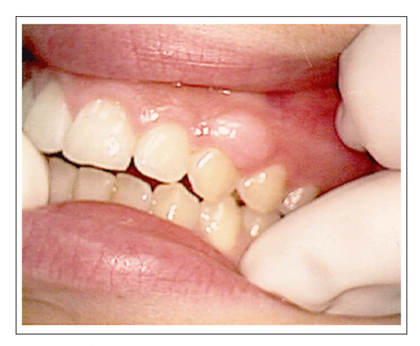
Figure 2. Case study patient, first recognition of lesion

Three years later the patient returned to the clinic, seeking preventive care. She had received no dental care in the interim and was now four months pregnant. Oral conditions were similar to her previous visit, but she was now concerned about the appearance of the dome-shaped lesion on the maxillary facial gingiva detected during the previous examination. It now measured 1.4 x 0.8 cm, extended to the mid-facial of the adjacent teeth, and exhibited greater buccal expansion (Figure 3). Because she was pregnant, the patient requested no radiographs. She completed preventive care but wished to wait and seek treatment for the lesion post-partem. Financial constraints prohibited referral to a local oral surgeon, so she was referred to the university's dental school-a two-hour drive from the dental hygiene clinic-for evaluation and treatment of the lesion.