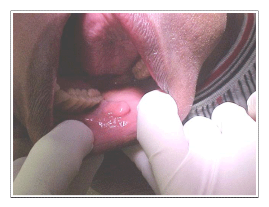
Figure 10. Irritation fibroma on the buccal mucosa of a middle-aged male

Location is a diagnostic characteristic of another histologically similar lesion as well, the retrocuspid papillae (Figure 11). Some sources define it as merely another form of GCF, <sup>8,10</sup> but the retrocuspid papilla has a very characteristic location on the mandibular lingual attached gingiva, inferior to the canine. It is a small, pink papule measuring up to 5mm and is frequently bilateral. The retrocuspid papilla is considered by some to be developmental <sup>7, 8, 16</sup> and, due to its clinical appearance and characteristic location, does not warrant biopsy, whereas irritation fibroma and GCF both require biopsy for definitive diagnosis. <sup>8</sup>