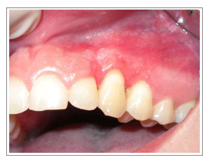
Figure 9. Three weeks post-op. Note the position of the marginal gingiva, apical to the CEJ, tooth #11