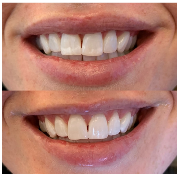
Figure 2. Before and after images of resin infiltration of the maxillary central incisors*