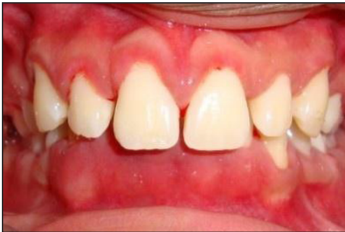
Figure 6: Maxillary arch 12 months postoperative view after gingivectomy

pliance removal and professional prophylaxis on periodontal health. 3