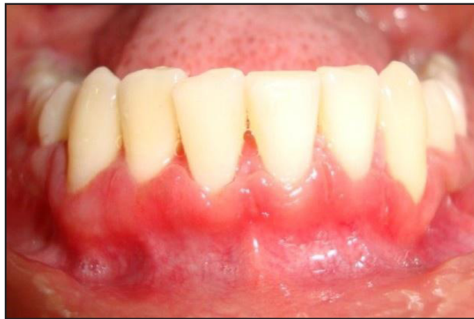
Figure 7: Mandibular arch 3 months postoperative view after gingivectomy

odontal therapy or does not meet the aesthetic and functional demands of the patient, surgical removal is the treatment of choice. The most widely employed surgical approaches for the treatment of gingival enlargements is gingivectomy or the flap technique.