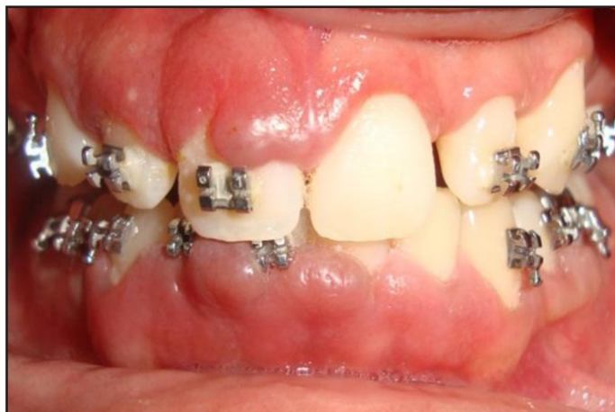
Figure 3: Intra-oral pre-operative left lateral view