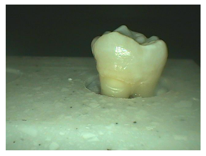
Figure 6: Root surface abrasion matches prophy cup diameter

Figure 5: Root surface abrasion seen apical to the mesiobuccal lobe