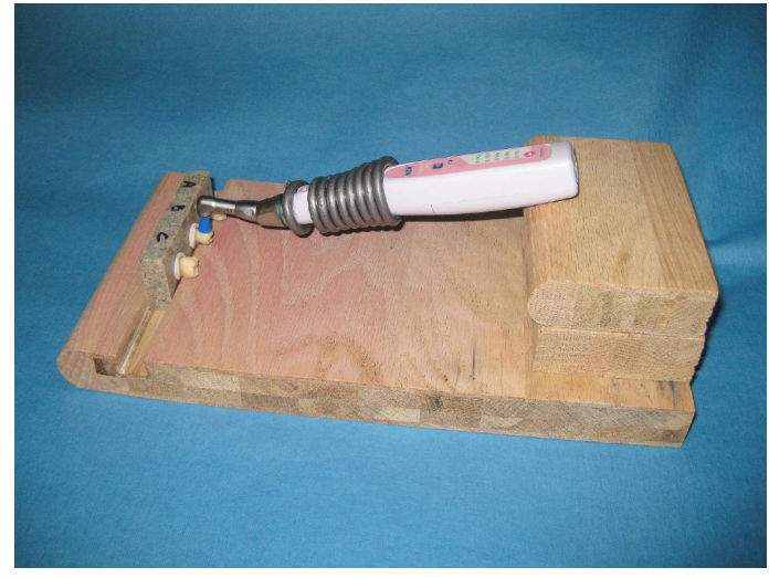
Polisher is held in position by a pin and can be moved forward, backward, or pivoted as needed. Lead weights provide consistent pressure, ~150 gm. Handpiece allows selection of cup rotation speed; 2500 rpm was used.

tion of a 2,500 rpm rotational speed used throughout the study. These parameters match those of Christensen et al.<sup>15</sup> Each tooth in the treatment group was subjected to a 5 second polishing 150 times on the buccal surface to simulate 75 years of semi-annual polishing. The slot on the polishing apparatus was slightly larger than the thickness of the Corian<sup>®</sup> blocks, allowing slight back and forth movement of the blocks. By moving the block back and forth during polishing, the cup was oscillated approximately 1 to 2 mm in a cervical-occlusal direction and distributed the rim pressure over the polished area. Each tooth was rinsed with distilled water after 5 polishes. Treatments were performed in sets of 50 polishing cycles per tooth, using new polishing cups and prophy paste for each set on every tooth. This was considered acceptable because each cup and paste unit is designed for clinical use on multiple-surfaces of a full dentition. Because of the broad buccal surface on molars, guide marks were placed on the occlusal and proximal surfaces to ensure the polished areas covered the area measured by the micrometer.