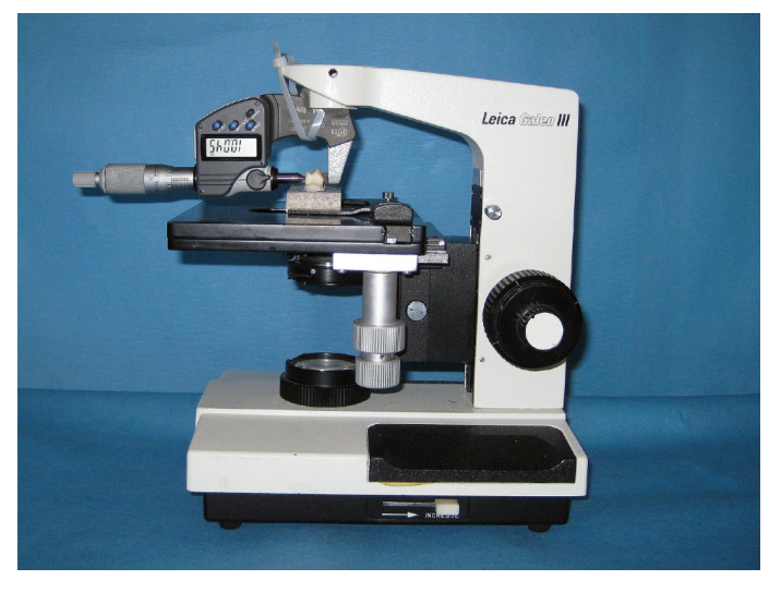
Figure 1: Measuring apparatus

Micrometer is mounted on microscope in nosepiece position. Teeth are mounted in blocks which are placed on stage. Microscope adjustment knobs allow precise positioning.