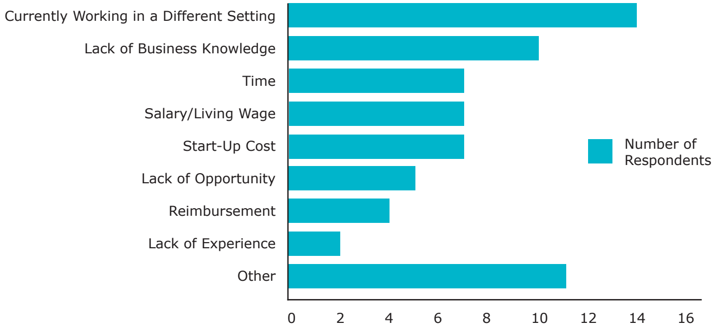
Figure 3: Perceived Barriers of Non-Practicing EPDHs (n=46)