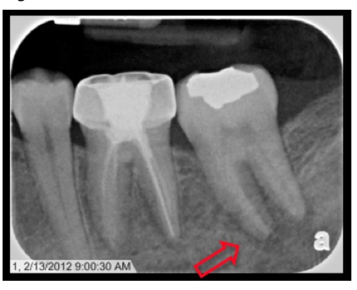
Moth-eaten borders and apical root resorption affecting and surrounding tooth #18

ness, clinicians should view this lack of response as a sign of urgency.<sup>2,8,11</sup> This was the case of a 37 year old male with no prior symptoms who experienced pain in the lower jaw after an adult prophylaxis. The patient was treated with erythromycin for 5 days, which failed to alleviate what was thought to be a dental infection. Findings from his magnetic resonance imaging (MRI) were within normal lim-