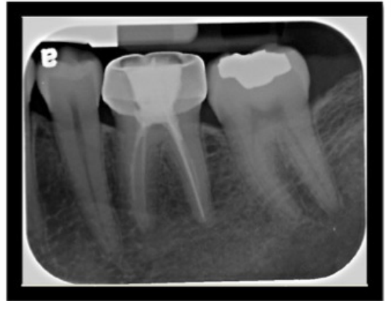
Top: Lower left premolar (left) and molar view (right) Bottom: Enlarged view of lower left molar

lapses of malignancies.<sup>5</sup> Unfortunately, in the instances where numb chin syndrome was detected and associated with cancer, the survival rate was poor. Statistics reveal that life-expectancy is less than 12 months from the date of diagnosis.<sup>2,5-7</sup> It is critical for dental professionals to be cognizant and acknowledge possible symptoms of numb chin syndrome in patients, especially for those with a history of cancer.