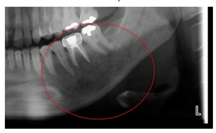
Figure 4: An Enlarged Section of the Pre-Surgical Panoramic Radiograph, Taken 5 Months after Initial Complaints of Numbness

Chronic systemic disorders such as diabetes or demyelinating disorders such as multiple sclerosis can lead to neuropathies and nerve damage. Possible sources of nerve damage in diabetes include high blood glucose levels, abnormal blood fat levels