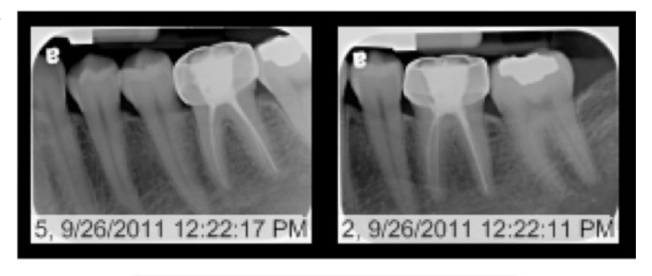
Figure 1: Periapicals From Partial Full Mouth Series on the Patient's Initial Complaints of Numbness

documented cases reported in the early 1800s by Charles Bell in a patient with breast cancer. 1,2 Since then, studies have reported a positive correlation linking neuropathies of the mental nerve to metastatic cancers. The most notable are recurrent cancers in the breast, lung and prostate, as well as leukemia and lymphoma; however, the strongest relationship with numb chin syndrome has been with breast cancer and lymphoma.<sup>1-4</sup> Research indicates a high number of instances where chin numbness runs parallel with the progression of or relapses in the aforementioned cancers. A systematic review by Galán-Gil et al reported 136 documented numb chin syndrome cases showing that numb chin syndrome has the greatest correlation with breast cancer (40.4%) followed by lymphoma (20.5%).3 This relationship is of importance to dentistry because the oral cavity is often sensitive to internal changes and will display signs of an obscure systemic disease long before it is discovered. It is important for clinicians to be thorough when reviewing a patient's medical history and while doing an intra/extra oral exam. One study found that in 47% of cases where numb chin syndrome was detected, the syndrome preceded the diagnosis of malignancy and in 30% of the cases examined, neuropathies preceded re-