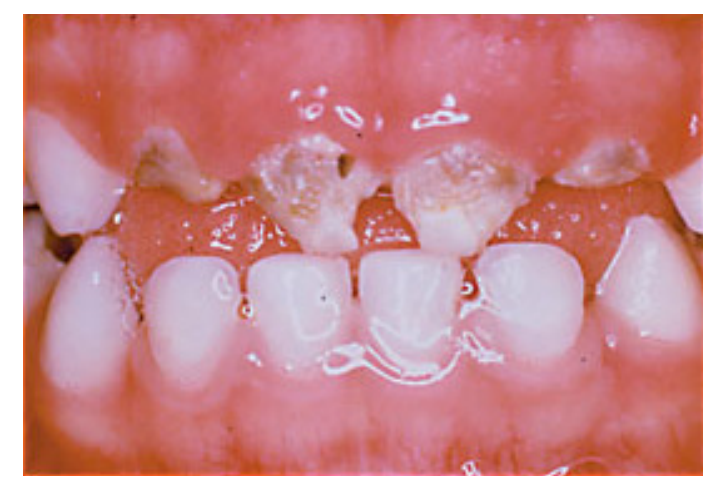
Figure 1: Clinical Signs of Severe–Early Childhood Caries<sup>17</sup>

the mouths of children with severe ECC when other pathogens were not detected.<sup>23</sup> Microorganisms play a major role in tooth demineralization and vertical transmission of caries from a mother or caregiver to child through close contact, shared food utensils and saliva.<sup>24-27</sup> The earlier the microorganism colonizes the primary teeth, the more likely the demineralization process begins.<sup>27</sup>